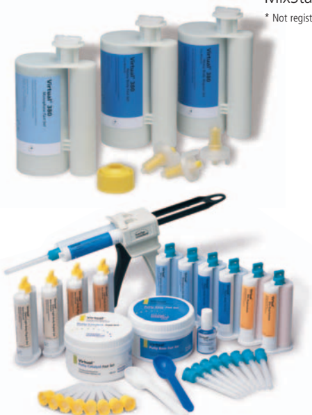
The complete Virtual line of products, including the new XXL cartridges

Descriptions and data constitute no warranty of attributes. Printed in Liechtenstein © Ivoclar Vivadent AG, Schaan/Liechtenstein 600690/0306/e/BVD