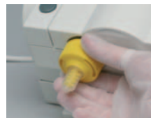
Place the bayonet ring and lock it into position by turning clockwise.

Virtual is a hydrophilic precision impression material based on vinyl polysiloxanes (addition-reaction silicones).