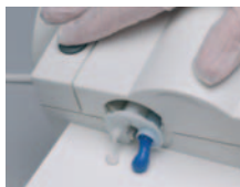
Dispense material without the mixing tip in place to verify an even flow of both components