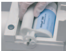
Insert XXL cartridge into the mixing unit