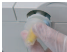
Attach the mixing tip