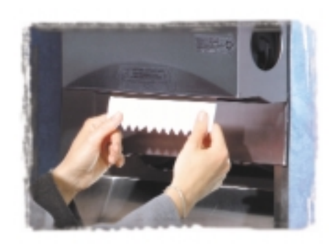
KLEENEX® 600' Hard Roll Towels are preferred 2-to-1 for softness over a leading competitive premium towel.