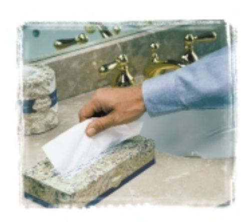
KLEENEX® brand was preferred for public restrooms more than any other leading brand*

59% - "When a restroom has brands I know from home – that makes me more comfortable."*