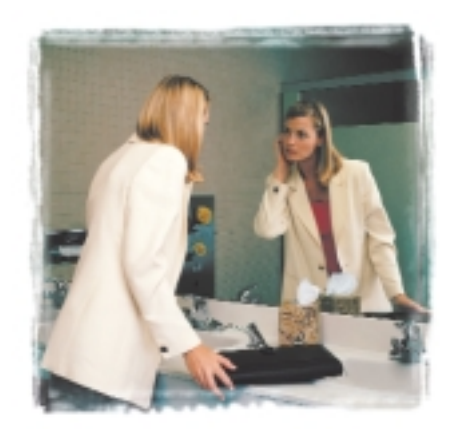
KLEENEX® brand is America's #1 brand of Facial Tissue.

52% - "Rough toilet paper says management doesn't care about me!"*