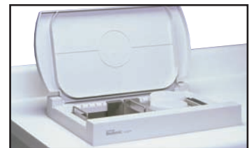
Recessed model installed