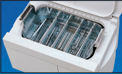
FULL BASKET WITH DIVIDERS