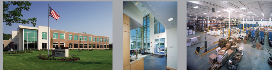
Our 200,000 sq. ft. manufacturing facility in Melville, NY.

Product Reliability and Innovation since 1962.