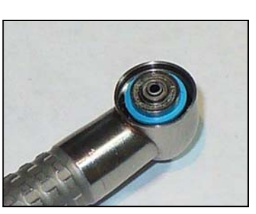
2 Insert turbine assembly into head housing