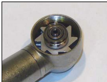
3 Insert turbine assembly into head housing