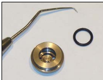
1 Place o-ring into back cap