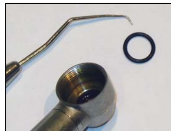
2 Place o-ring into head housing