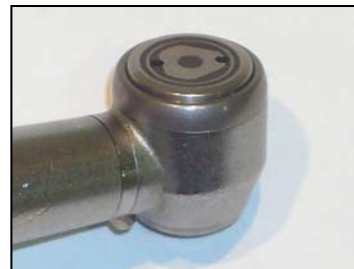
4 Screw on back cap, refer to section 5 of the TA Installation Procedure