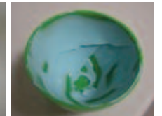
0-30 sec. Fuschia during mixing