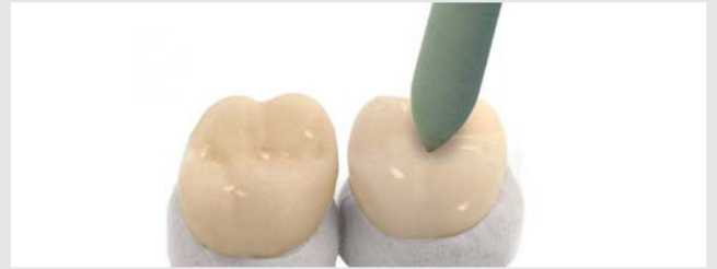
9507H: High gloss polishing of the occlusal surface and crown external shape, Recommended rotary speed: 7.000 - 12.000 rpm