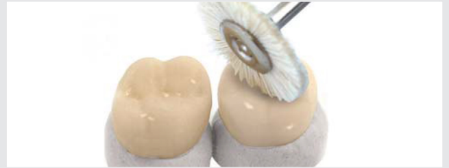
100: Working the polishing paste into the material surface using a soft polishing brush, Recom. rotary speed: 10.000 - 15.000 rpm