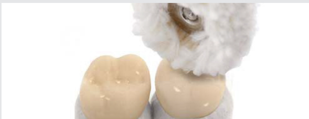
150: High gloss polishing of the crown with a cotton buff, Recommended rotary speed: 7.000 - 12.000 rpm