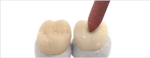
9507P: Smoothing of the occlusal surface and crown external shape, Recommended rotary speed: 7.000 - 12.000 rpm