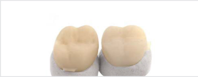
Unprocessed state of a fully anatomical resin nano-ceramic crown