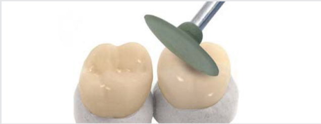
9508H: Targeted high gloss polishing, e.g. of fissures, Recommended rotary speed: 7.000 - 12.000 rpm