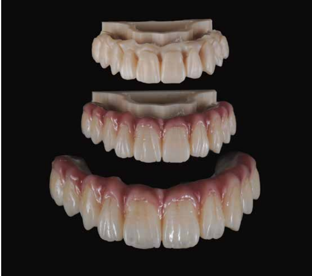
Based on KATANA™ Zirconia YML A3 with CERABIEN™ ZR FC Paste Stain