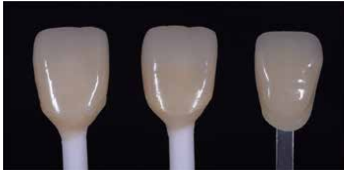
KATANA™ Zirconia YML A3

Comparison with high translucency zirconia