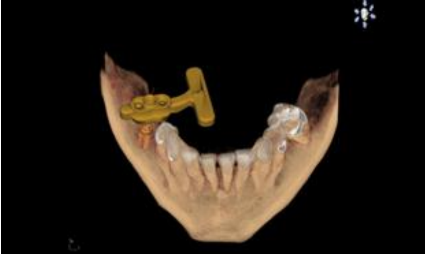
Reference body in the GALAXIS software, implant planning