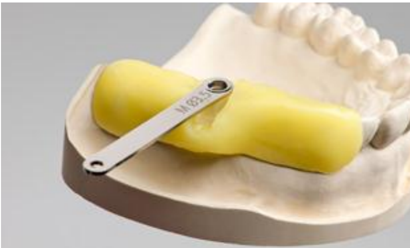
CEREC Guide with drill key