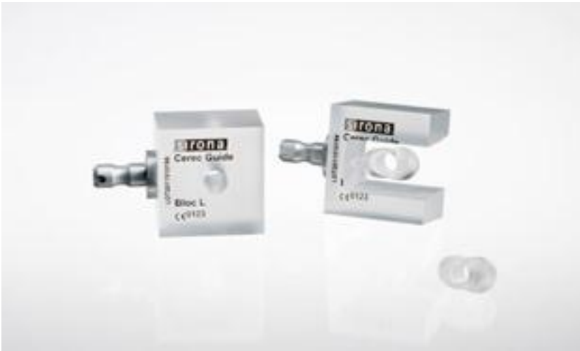
Milled drill body