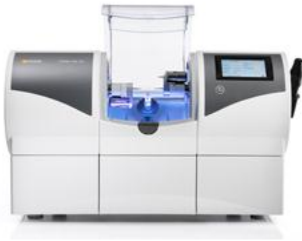
Milling with the CEREC MC X / MC XL / MC XL Premium Package or inLab MC XL