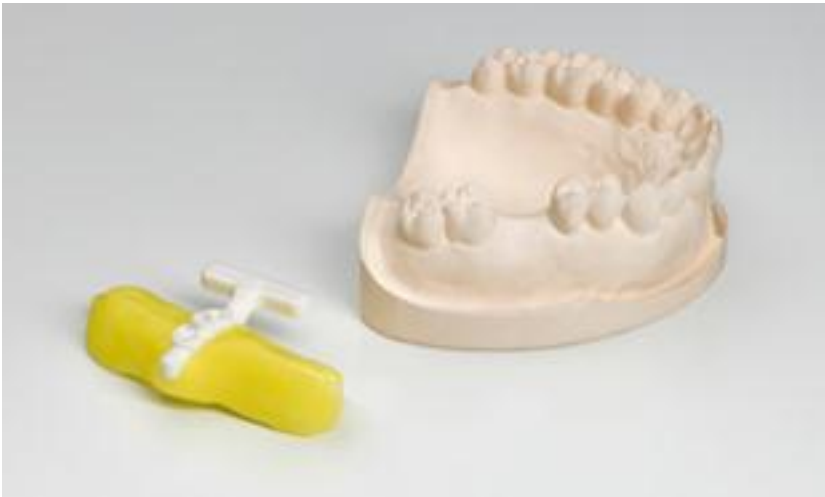
Preparation of the scan body on the model

For more information on this or other CEREC integration topics, please visit www.sironausa.com under the Integrated Implantology section