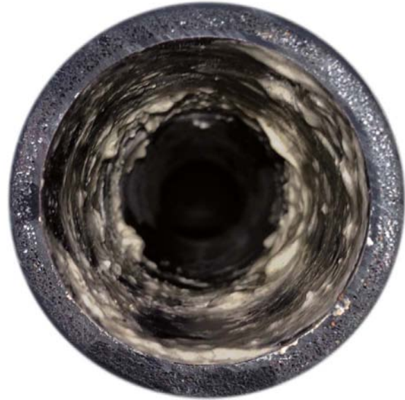
FIGURE 2 - Debris inside suction pipe after Bio-Pure Microbial Cleaning.

It is a good and important clinical exercise for every practice to accurately measure their suction power level as part of their annual evacuation pump service.