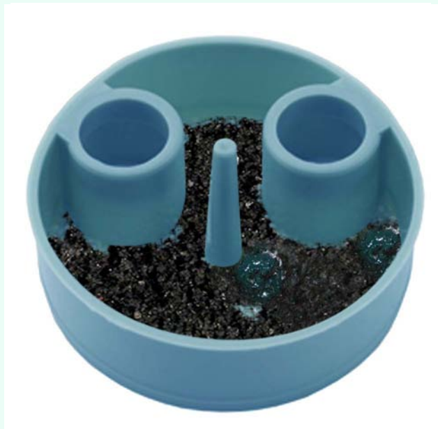
FIGURE 3 - Sludge, bacteria and debris in operatory trap.