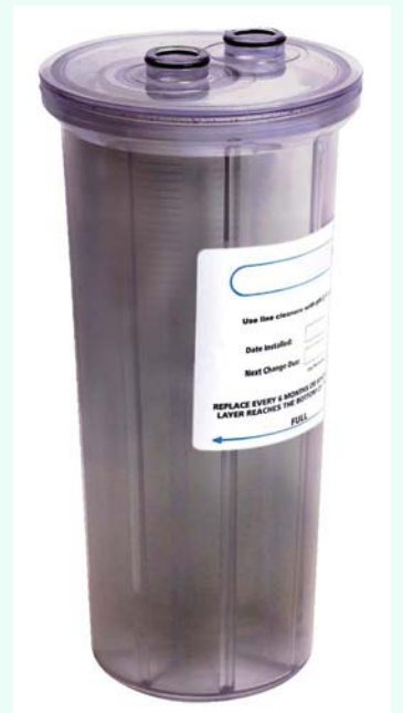
FIGURE 6 - Suction filter (after).

there is, the more the bacteria digest (Figs. 3&4).