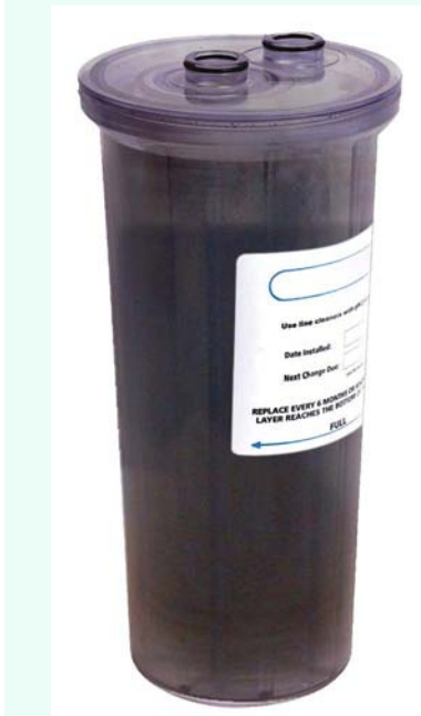
FIGURE 5 - Suction filter (before).

Microbiology-based cleansing products are typically safer than their chemical counterparts; they are organic and do not contain any materials that are harmful to people or the environment. They clean very differently from traditional compounds that dissolve accumulated waste, leaving it to settle elsewhere in the system such as traps, filters, pipe walls or amalgam separators; microbiology-based cleaners rely on living bacteria to eat/digest organic waste. The bacteria consume prophylaxis paste, organic tissues, and other waste materials. The more waste