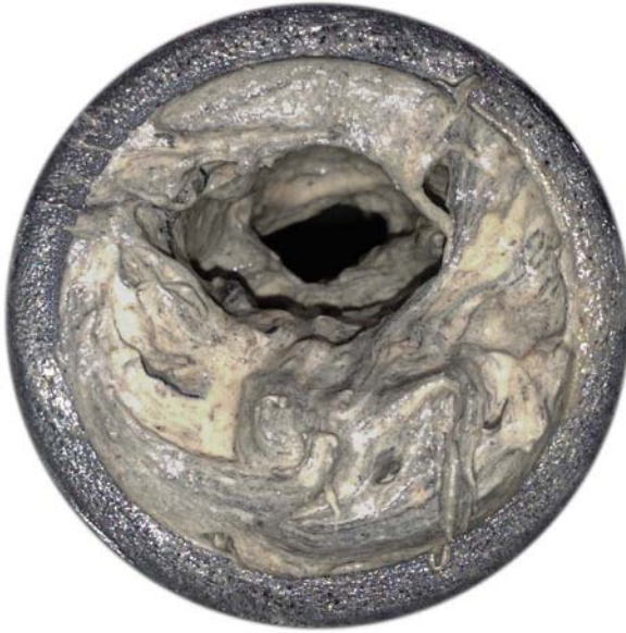
FIGURE 1 - Debris inside suction line builds over time.