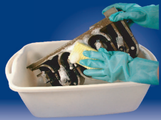
CLEAR IMAGE Weekly