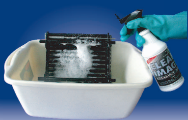
CLEAR IMAGE Weekly