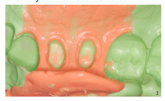
Supragingival margins and relatively healthy tissue The sulcular expansion NoCord creates often is the perfect case for NoCord!