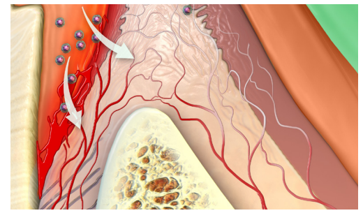
NoCord Wash and its 15% alum (ammonium aluminum sulfate) astringent against the gingiva helps eliminates re-bleeders and pooling of blood, while protecting fragile tissue.