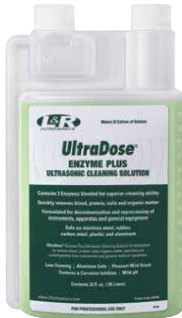
32 oz. Bottle Pr. Code: UD038

L&R Manufacturing Company 577 Elm Street, P.O. Box 607 Kearny, NJ 07032-0607 USA Tel: 201.991.5330 Fax: 201.991.5870