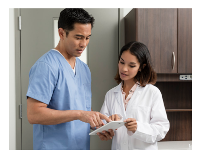
Online medication tracking Access OnTrag at no additional cost.